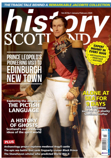
Cover, & see inside 'Prince Leopold of Saxe-Coburg's entry into Edinburgh, 1819.' History Scotland , Jan./ Feb. 2020, pp. 8-10.